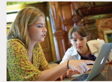
2 _____ Intellectual enrichment /8