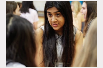
3 _____ Leadership opportunities /10