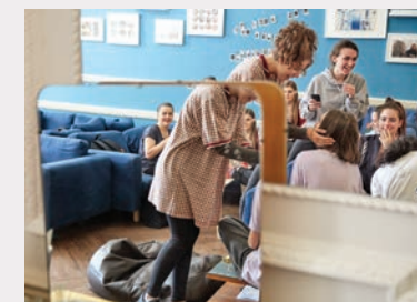
8 _____ Charity & Community /26