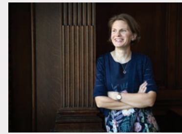
1 _____ Welcome to South Hampstead Sixth Form /4

This is the time. The time to question, to explore, to create, to have a say and to take the lead. The time to thrive and grow. This is the time to discover your own direction.