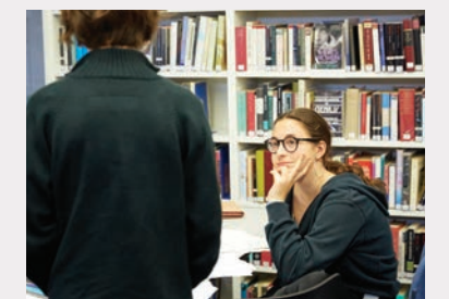
6 _____ Pastoral care /20