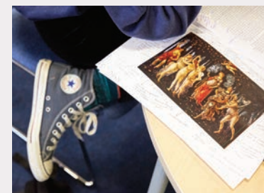
7 _____ Scholarships & Bursaries /22