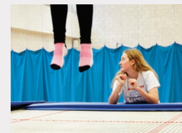
5 _____ Sport /16