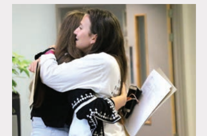
9 _____ Life beyond /28