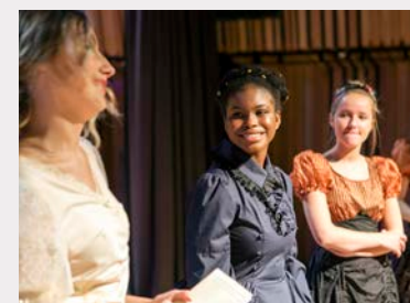
4 _____ The co-curriculum /14