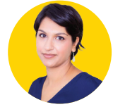
ANGELA SAINI feminist Science writer and author of Inferior and The Return of Race Science