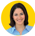
MISHAL HUSAIN presenter of Radio 4's Today programme, on challenging inequality