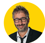
DAVID BADDIEL author and comedian, on his book about anti-Semitism, Jews Don't Count