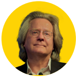
PROFESSOR A C GRAYLING CBE the philosopher and author, discussing democracy