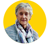
DAME STELLA RIMINGTON MBE the first female Director General of MI5