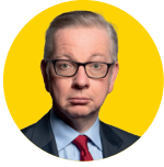
RT HON MICHAEL GOVE MP as Secretary of State for Environment, Food and Rural Affairs