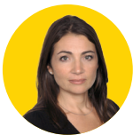
KATYA ADLER BBC Europe Editor and former South Hampstead pupil on Brexit