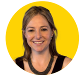
PROFESSOR ALICE ROBERTS anthropologist, author and TV presenter, on the survival of our species