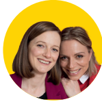
KATE AND HELEN RICHARDSON-WALSH Olympic Gold Medal hockey players