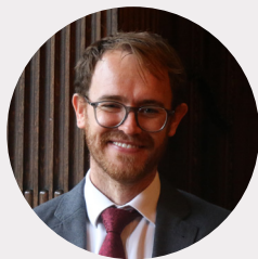
DIRECTOR OF SIXTH FORM

South Hampstead Sixth Form is headed up by a team of experts on hand to help guide and support you throughout your time here and prepare you for life beyond school.