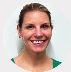
HEAD OF LOWER SIXTH