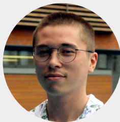
HEAD OF UPPER SIXTH