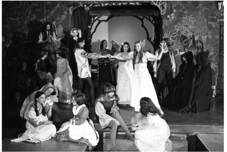
A Winter's Tale, 1975