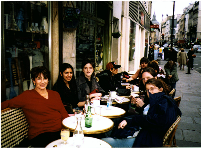
French Trip, 2005