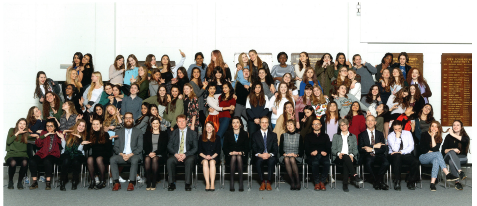
Year Group Photo, Class of 2015