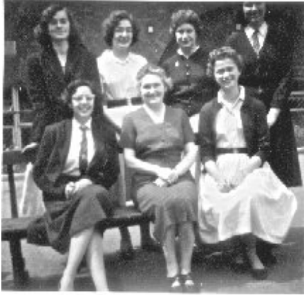
French Division Class Photo, 1950s